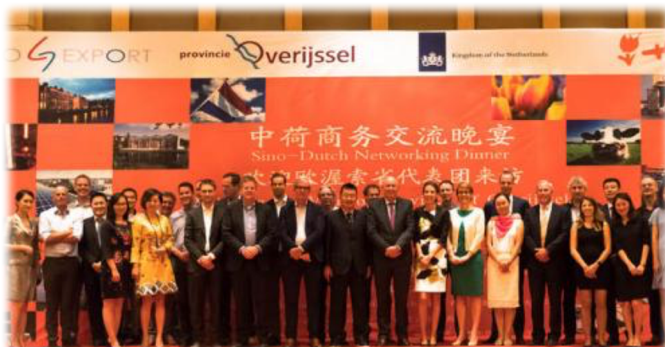
Partner of Dutch trade mission to China -2018