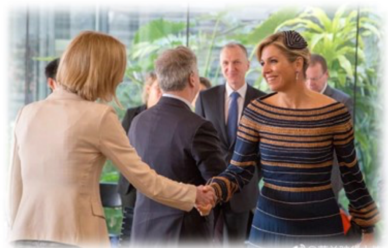
Rabobank on green finance Beijing 2017