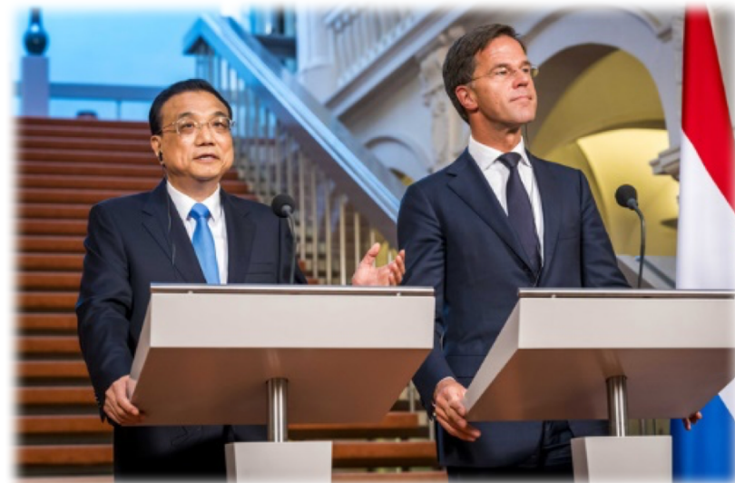
Support China-NL Business Forum -2018